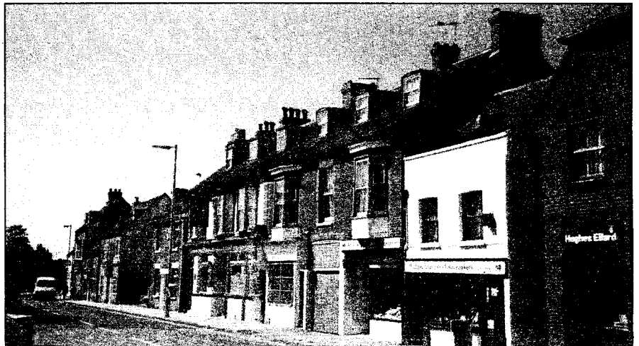
The group of domestic buildings on the north side of West Street exhibit the local style and materials of the 19th Century

Park Road evolved as a short cul-de-sac running northwards to Havant Park which was opened in 1889. Following the reconstruction of the railway station and the closing of North Street in 1937, Park Road North and Park Road South were opened as a new route through the town. These roads are now the principal routes into the town centre from the north and south and have effectively severed that part of West Street containing the Black Dog Conservation Area from the eastern section of West Street, within the Town Centre, which has now been pedestrianised.