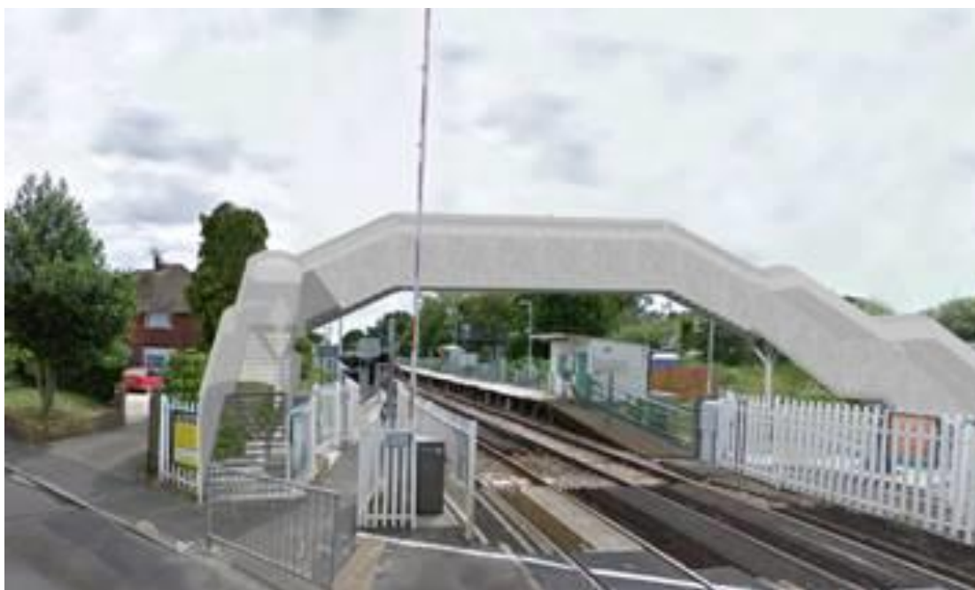
Figure 2.5: Potential crossing solution for Warblington Footbridge – for illustrative purposes only

2.15 2020/2021 Strategic CIL Expenditure will also include funds committed at Council 27 February 2019 in respect of ongoing spends for the Langstone Flood and Coastal Erosion Risk Management (FCERM) Scheme and the Hayling FCERM Strategy totalling £745,700, which were and are still regarded as being critical to delivery of the Local Plan. There are