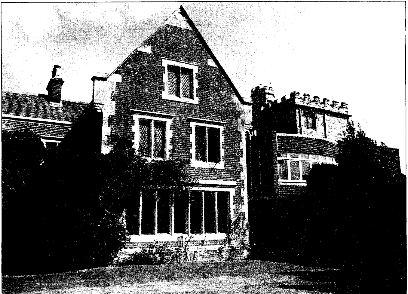
Wade Court House

Although the surrounding trees maintain the seclusion of Wade Court House, a feature of the Conservation Area is the degree to which the landscape can be enjoyed by the general public due to the network of public footpaths which adjoin and cross the area.